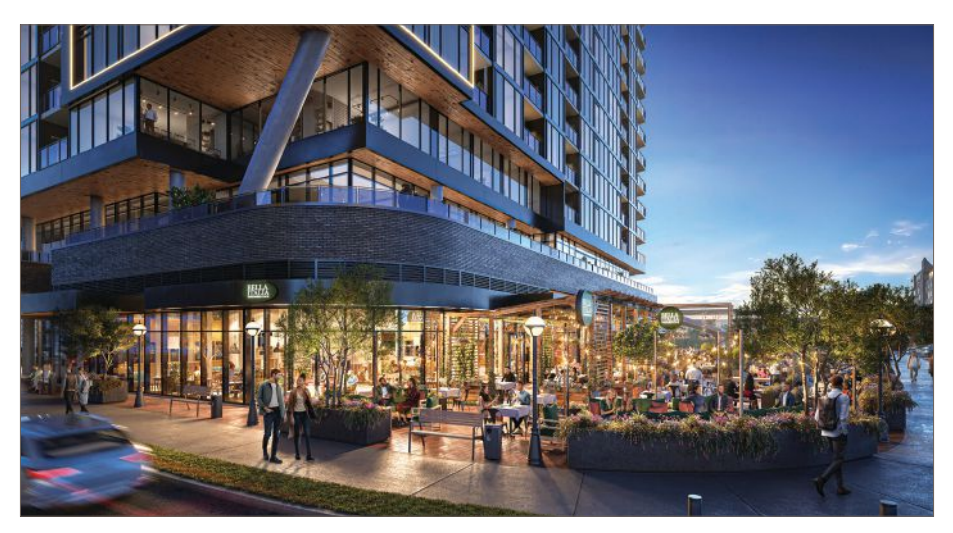
New developments are focusing on entertainment for success. CIM's Centennial Yards in Atlanta, built around sports venues Mercedes-Benz Stadium and State Farm Arena, is expected to debut a number of entertainment and food-and-beverage offerings as it opens in phases over the next few years.