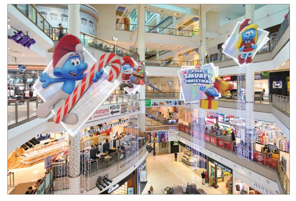
Brands are also getting in on the act with entertainment retail. The Smurfs plans to open location, capitalizing on an upcoming new movie and a new TV series.

"Avoid getting distracted by macroeconomic factors and focus on the entertainment experience for your customers," he advises. "Entrepreneurs cannot control interest rates, inflation or global pandemics. But we can control the quality of our guest experience and how people will speak to their friends and family members. Smart investors look at where your concept can be in five years. Demonstrating product-market fit and build-