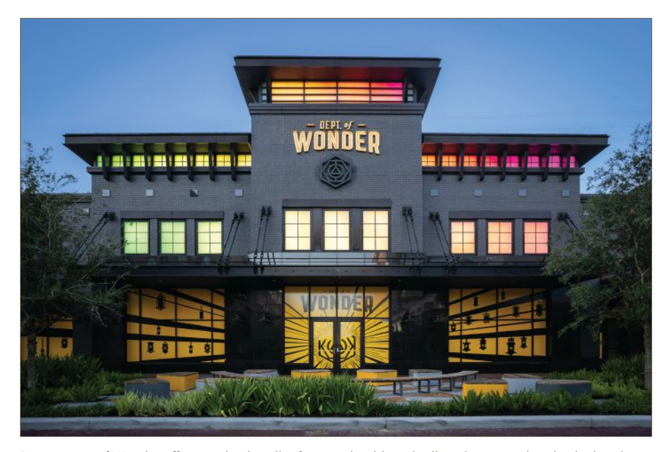
Department of Wonder offers a mixed-reality fantasy that blurs the lines between the physical and digital worlds. The concept's first unit is located at Sugar Land Town Square in Houston.

Goldfarb is careful to note, however, that recession-proof doesn't mean bulletproof. After all, entertainment falls under the discretionary spending category, which means the choice on whether to spend — and where to spend — lies solely with the consumer.