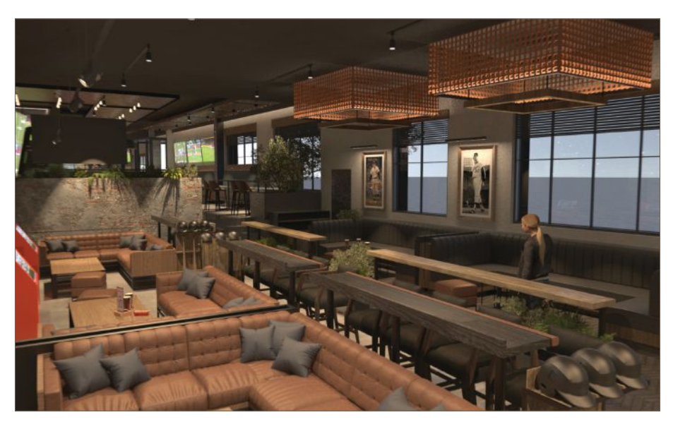
Batbox, a baseball simulator experience, will open its first location in the U.S. in Texas this year.

"I'm a huge believer in tourism markets for entertainment and retail, so that's where I'm focused," he says. "If I was a retailer or entertainment concept looking for growth, I would focus on tourism markets with flagship experiences because you get to expose your brand to as wide a swath of the population as possible. People will make small sacrifices all year in order to keep that annual family vacation alive."